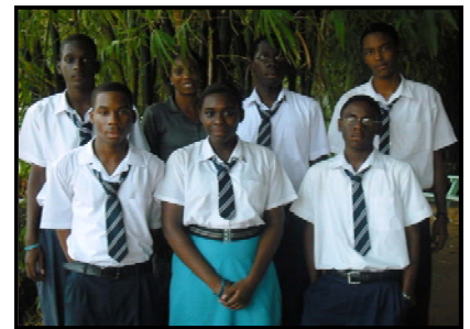
JCRA members at the Alexandra School"

Students attending schools in close proximity to the Folkestone Marine Reserve now have the opportunity to become stewards of the environment through the Junior Coral Reef (JCR) Ambassador programme.