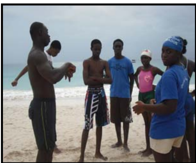
Learning to swim at Carlisle Bay

Various equipments for the reef surveys were obtained for the Reef Watchers. These will be stored at Hightide Watersports for subsequent dives. In addition, a Reef Watchers instructional video will be prepared for divers to supplement the Reef Watchers manual.