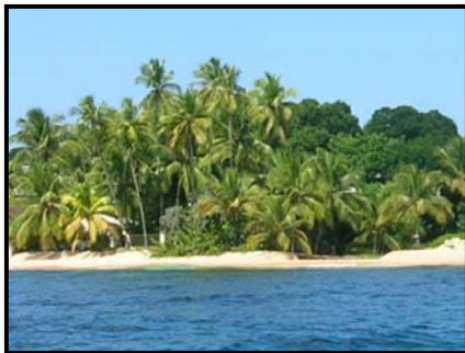
West Coast beach that they are trying to preserve

The day was thoroughly enjoyed by all those who participated. The St. James Environmental Movement (JEM) has recruited several residents from the parish to assist them in upcoming reef and beach clean ups aimed at protecting our precious coast and keeping our beaches beautiful.