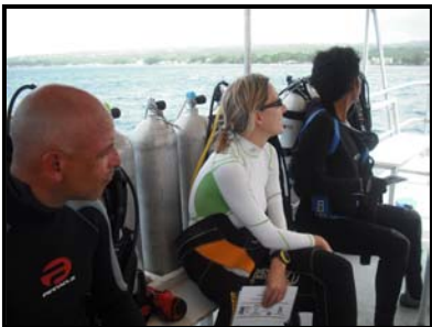
Reef watchers preparing for survey

The distribution of the workbooks also provided the opportunity to inform more schools across the island about the project.