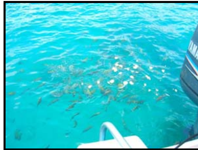
Feeding the fish'

On Saturday, August 30, 2008, the St. James Parish Independence Committee conducted an educational tour aboard the glass bottom boat 'Fantasea'. Patrons boarded at Weston Beach and were treated to a two hour tour along the coast of St. James.