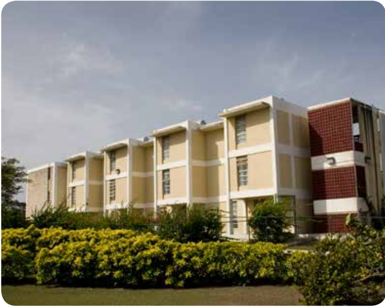
Sherlock Hall (Map MAIN CAMPUS Ref 3)