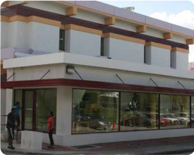
Campus Bookshop (Map MAIN CAMPUS Ref 8)

Please refer to the Campus Map on page 150 for site locations.