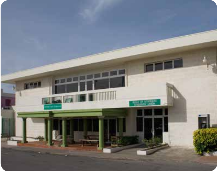
Office of Guild of Students / Student Health Clinic (Map MAIN CAMPUS Ref 6)

Please refer to the Campus Map on page 150 for site locations.