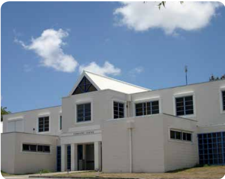
Campus IT Services (Map MAIN CAMPUS Ref 23)

Please refer to the Campus Map on page 150 for site locations.