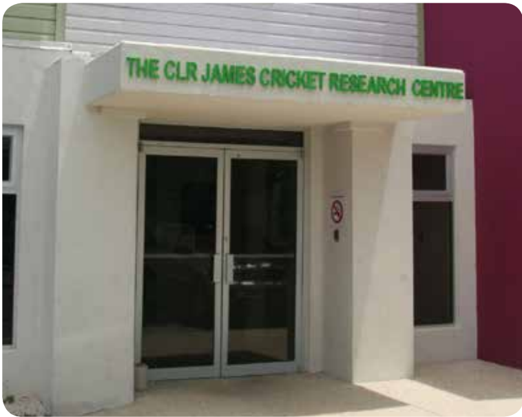
CLR James Centre for Cricket Research (Map MAIN CAMPUS Ref 2a)

Please refer to the Campus Map on page 150 for site locations.