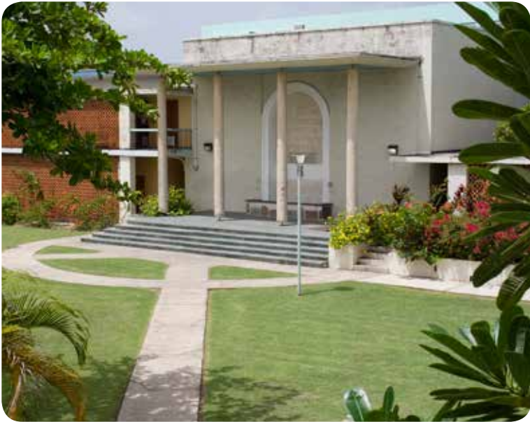
Arts Lecture Theatre (Map MAIN CAMPUS Ref 20a)