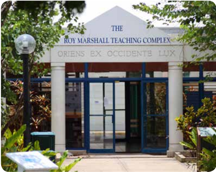
Roy Marshall Teaching Complex (Map MAIN CAMPUS Ref 24)