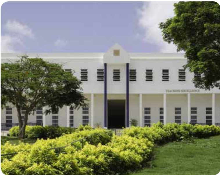
CLICO Centre for Teaching Excellence (Map MAIN CAMPUS Ref 27a)

Please refer to the Campus Map on page 150 for site locations.