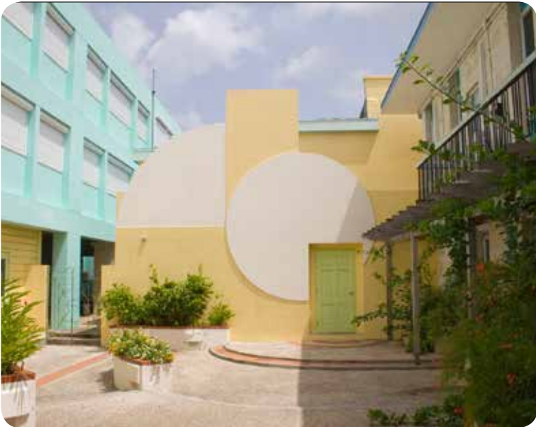
Faculty of Humanities and Education (Map MAIN CAMPUS Ref 20)

Please refer to the Campus Map on page 150 for site locations.