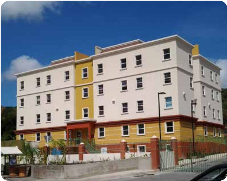
Keith Hunte Hall (Map PARADISE PARK Ref 45)