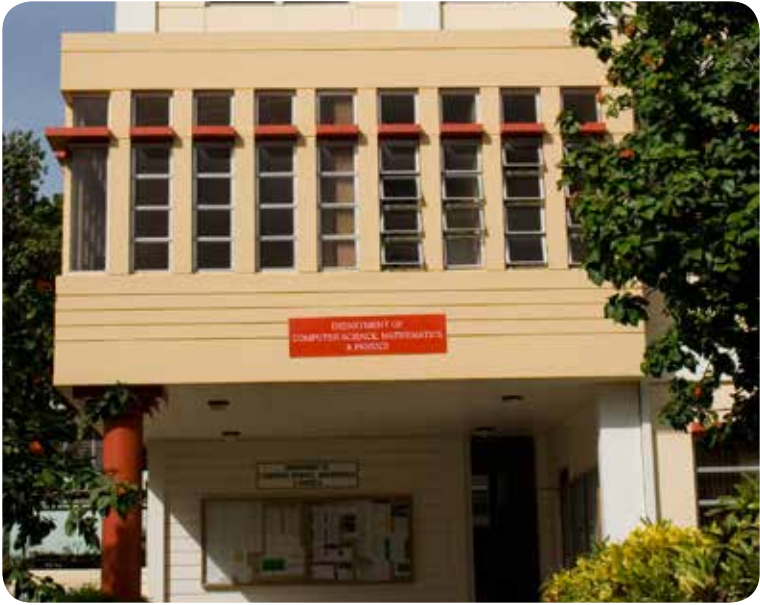
Dept. of Computer Science, Mathematics & Physics (Map MAIN CAMPUS Ref 17)