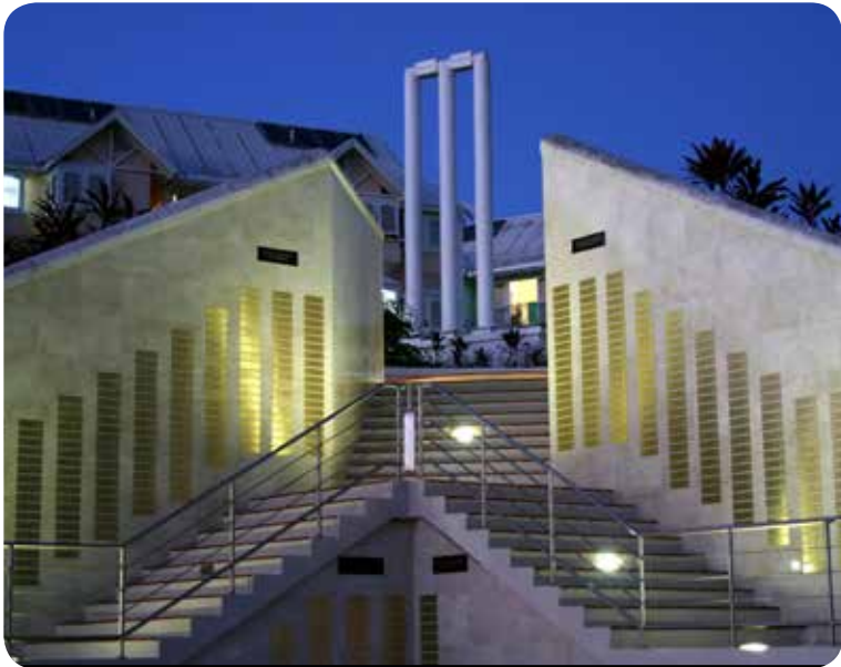
Walk of Fame (Map MAIN CAMPUS Ref 31)

Please refer to the Campus Map on page 150 for site locations.