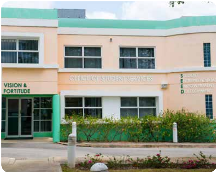
Office of Student Services / SEED (Map MAIN CAMPUS Ref 15)

Please refer to the Campus Map on page 150 for site locations.