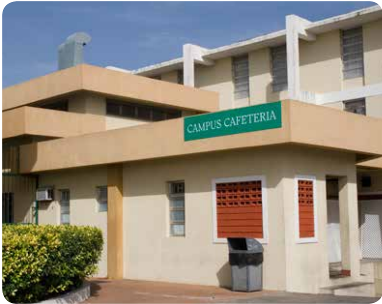
UWI Cafeteria (Map MAIN CAMPUS Ref 5)