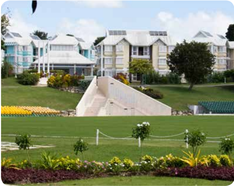
The Oval (Map MAIN CAMPUS Ref 31)