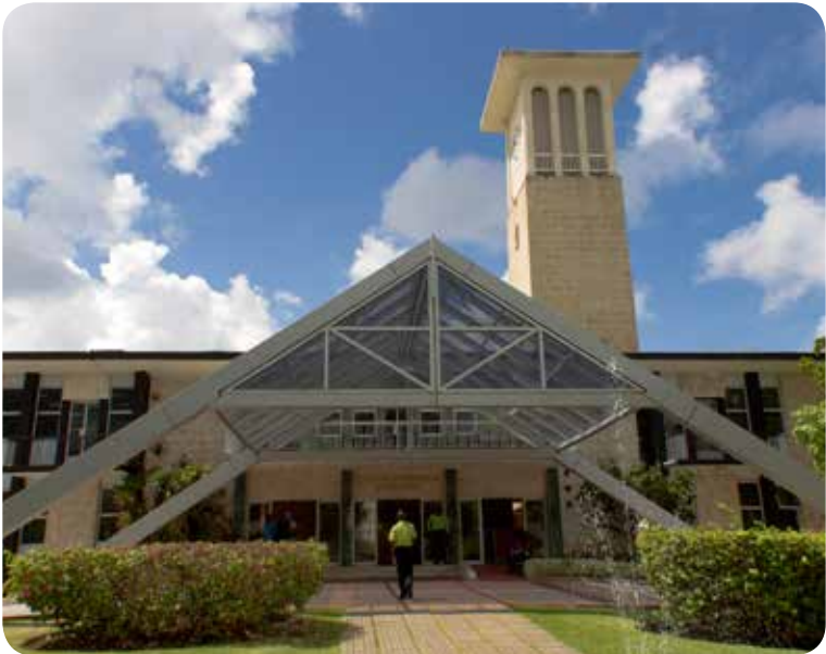
Leslie Robinson Building / Medical Sciences Administration (Map MAIN CAMPUS Ref 21)

Please refer to the Campus Map on page 150 for site locations.