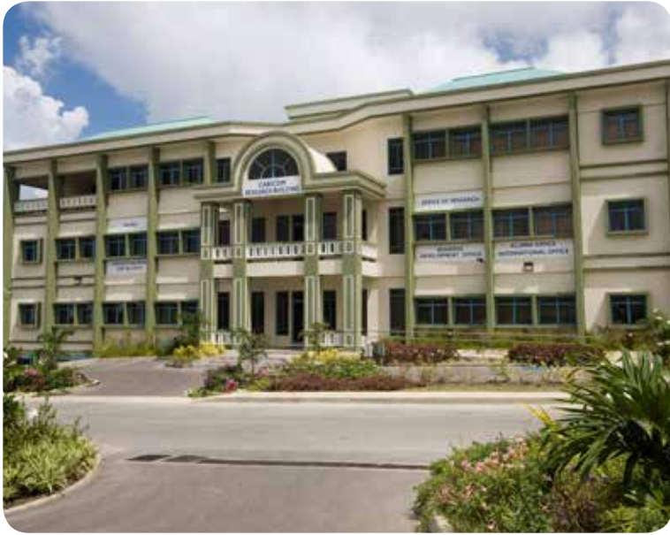
CARICOM Research Building (Map CARICOM PARK Ref 37)