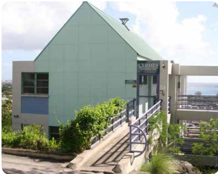
CERMES (Map MAIN CAMPUS Ref 12)

Please refer to the Campus Map on page 150 for site locations.