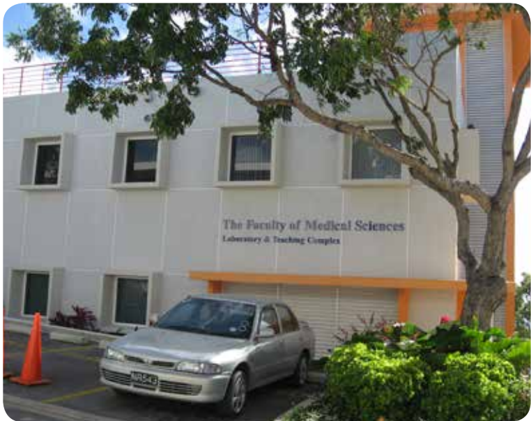
Medical Sciences - Laboratory and Teaching Complex (Map MAIN CAMPUS Ref 11)

Please refer to the Campus Map on page 150 for site locations.