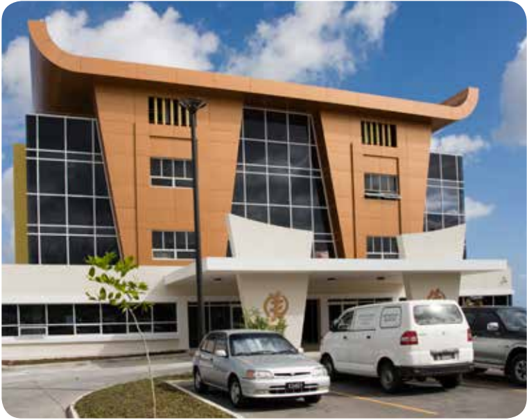
“The Golden Stool” Main Administration Building (Map MAIN CAMPUS Ref 42)