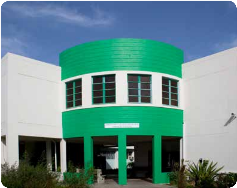
Dept. of Biological and Chemical Sciences (Map MAIN CAMPUS Ref 18)