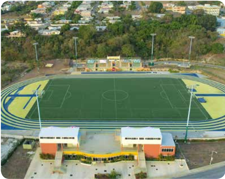
Usain Bolt Sports Complex (Map PARADISE PARK Ref 46)

Please refer to the Campus Map on page 150 for site locations.