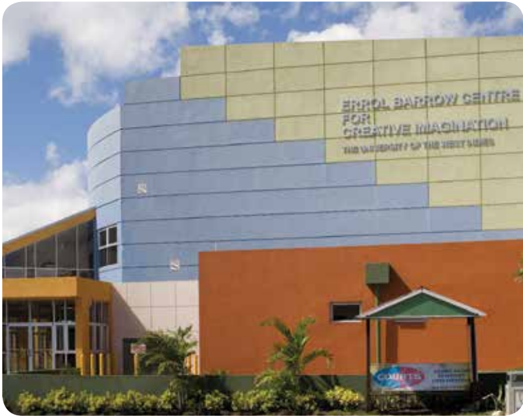
The Errol Barrow Centre for Creative Imagination (Map MAIN CAMPUS Ref 39)

Please refer to the Campus Map on page 150 for site locations.