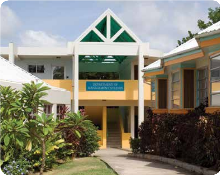
Dept. of Management Studies (Map MAIN CAMPUS Ref 22)