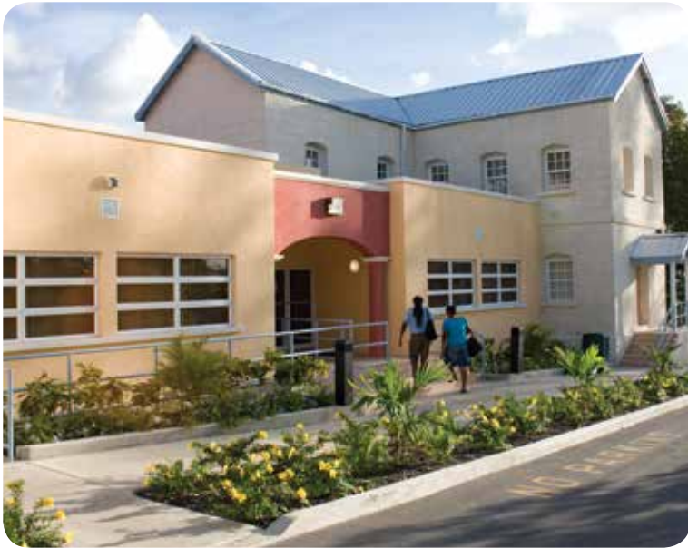
Postgraduate Administration & Teaching Complex (Map PARADISE PARK Ref 43)

Please refer to the Campus Map on page 150 for site locations.