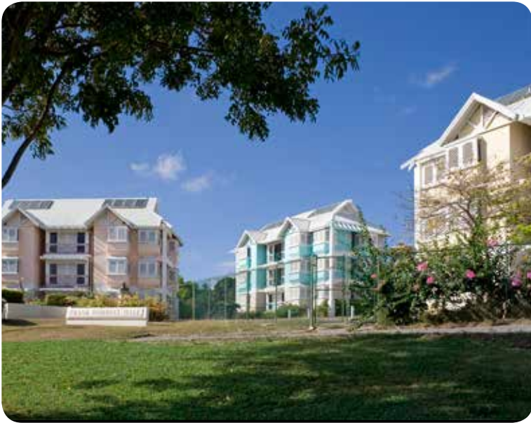
Frank Worrell Hall (Map MAIN CAMPUS Ref 33)

Please refer to the Campus Map on page 150 for site locations.