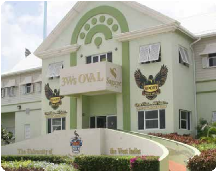
The Pavilion, 3Ws Oval (Map MAIN CAMPUS Ref 1)