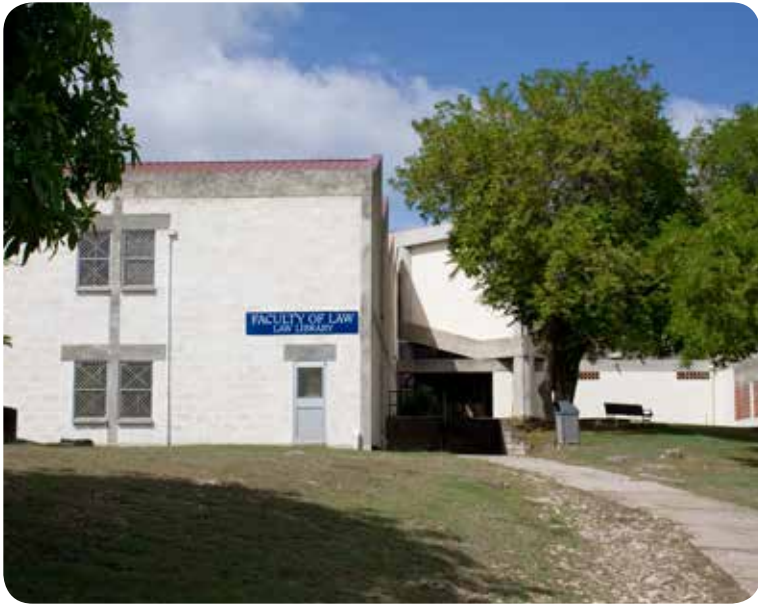
Faculty of Law (Map MAIN CAMPUS Ref 26)