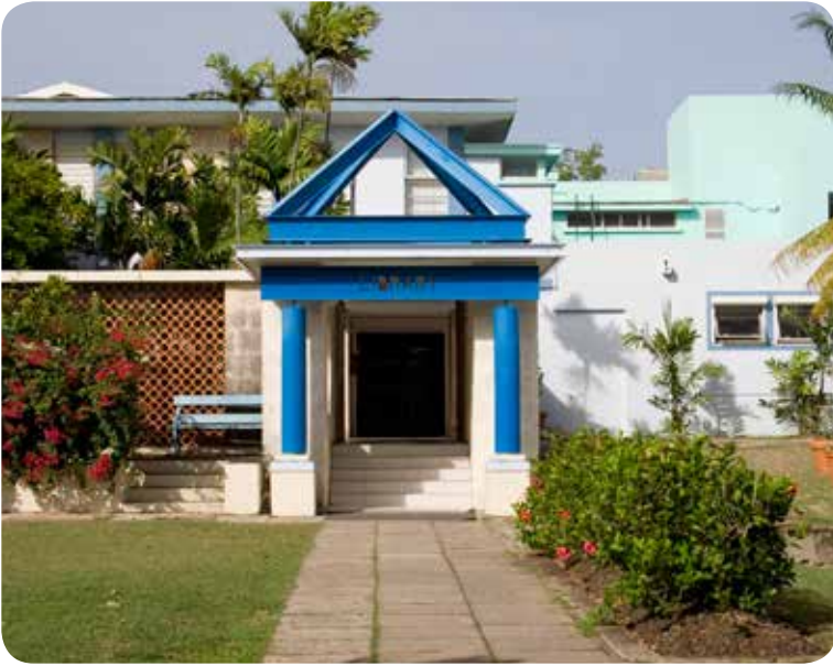
Sidney Martin Library (Main Library) (Map MAIN CAMPUS Ref 19)