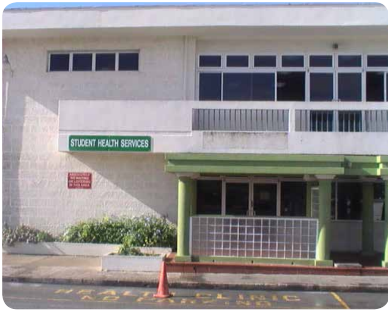
Student Health Services (Map MAIN CAMPUS Ref 6)