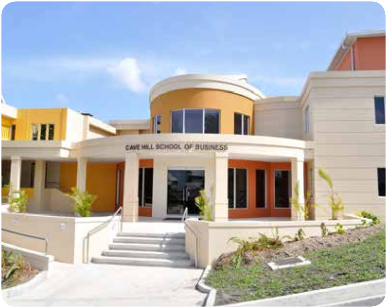
Sagikor Cave Hill School of Business (Map CARICOM PARK Ref 36)

Please refer to the Campus Map on page 150 for site locations.