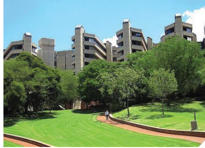
From left, the University of the West Indies, Cave Hill Campus, Barbados; and the University of Johannesburg, Auckland Park Kingsway Campus.